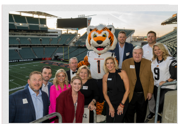
Hearts for Hope 2022