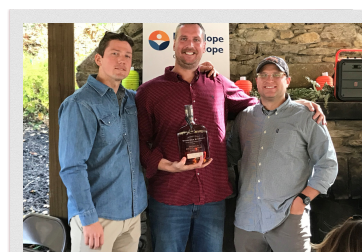
Fall Fest Clay Shoot 2022